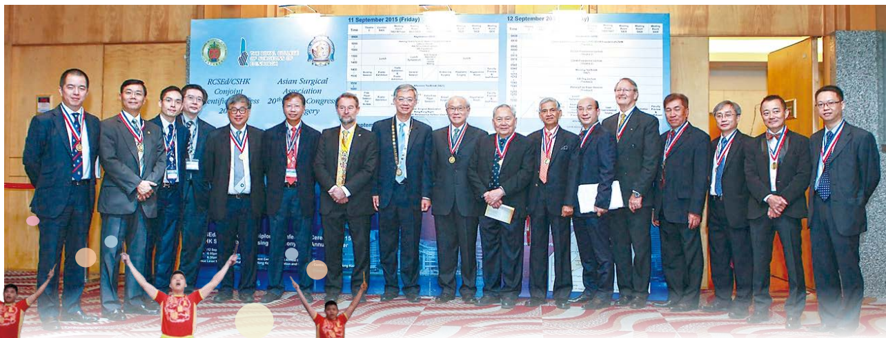
The Council and Past Presidents of the ASA