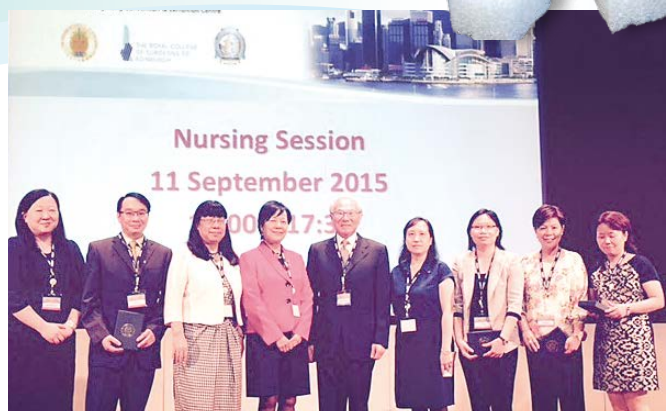
The Nursing Session