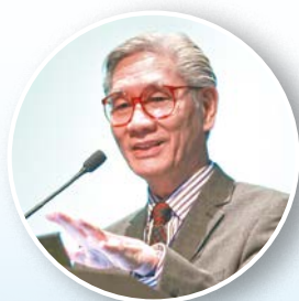
GB Ong Lecture Orator – Professor Shew-Ping Chow

The scientific program encompassed a wide spectrum of symposia on the latest surgical treatment strategies and advances in different surgical subspecialties in order to achieve the best patient-outcomes. Apart from symposia and free paper sessions, a nursing session was incorporated into the program to acknowledge nurses' contributions to the surgical field.