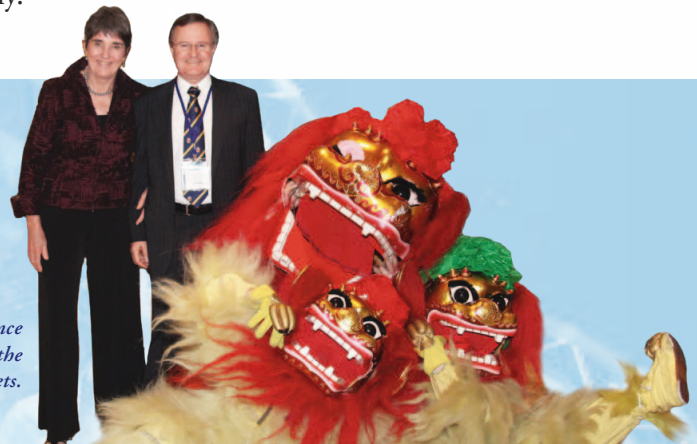
A lively lion dance performance to mark the beginning of the Congress Banquets.