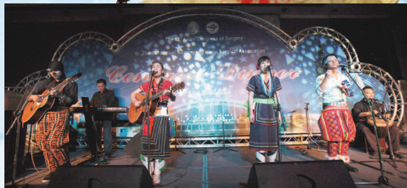
A energetic and entertaining folk song and dance performance during the Congress Banquet.