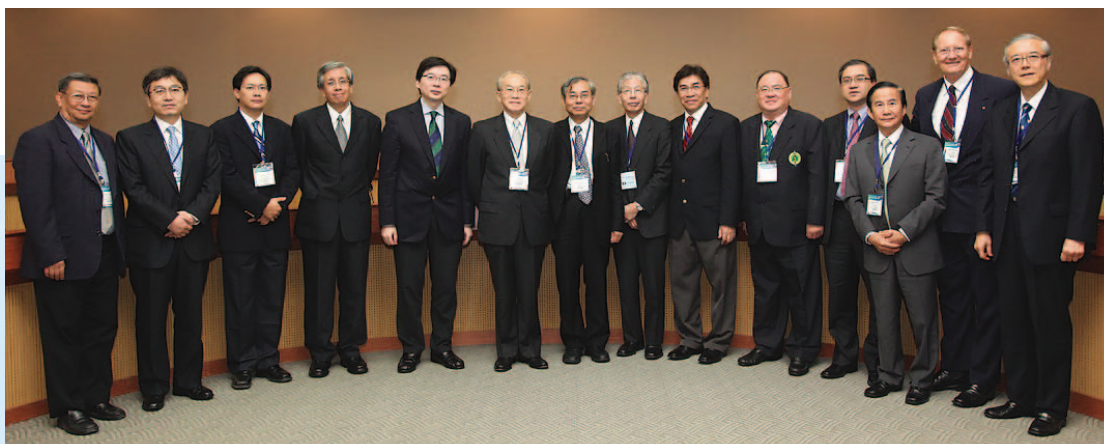
The Officers and Council of the Asian Surgical Association

The Scientific Program covered a broad variety of topics like breast surgery, endocrine surgery, hepatobiliary and pancreatic surgery, liver transplantation, paediatric surgery, trauma, upper gastrointestinal surgery, urology, vascular surgery, and minimally invasive surgery. There were 96 sessions with 5 named lectures, 5 plenary lectures, 28 symposia, 3 instructional lectures, and 55 free paper sessions. A total of 808 free papers were accepted for presentation at the Congress, among which 324 and 484 were oral and poster presentations, respectively.