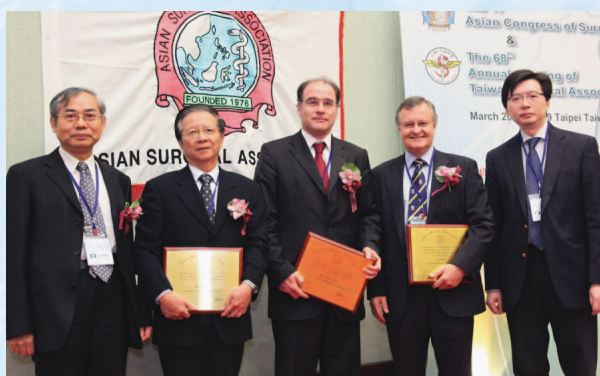
Conferment of Honorary Membership was held at the Opening Ceremony.