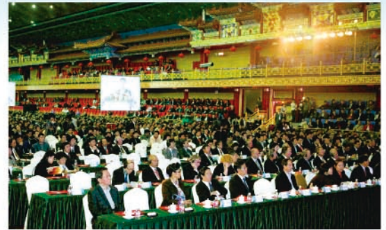
The grand Opening Ceremony was well attended by around one thousand delegates.