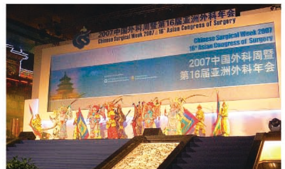
The impressive Beijing Opera performance at the Opening Ceremony.