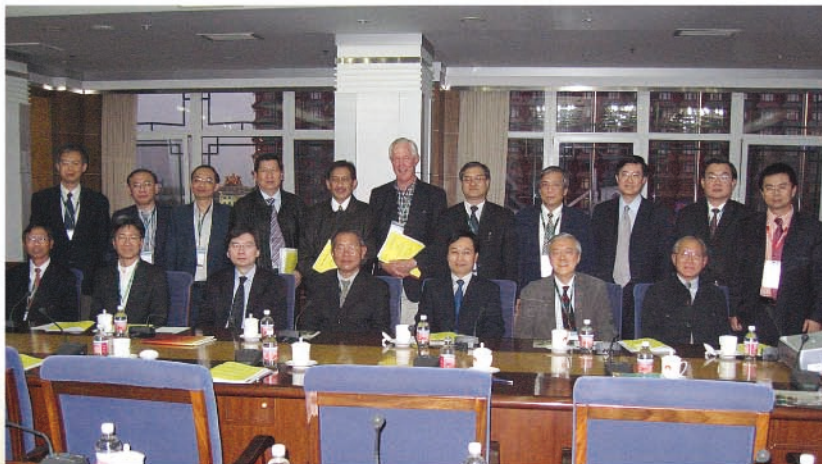
The Officers and Council of the Asian Surgical Association.

The 16th Asian Congress of Surgery was a memorable and valuable event and we are looking forward to the 17th Asian Congress of Surgery in Taipei!