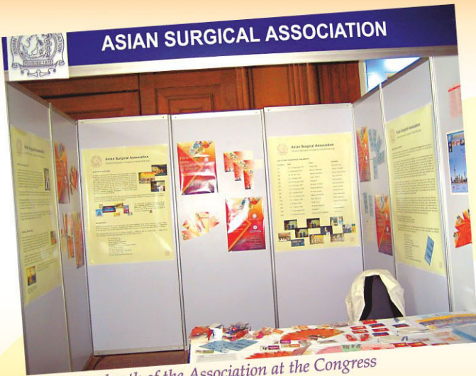
Exhibition booth of the Association at the Congress

The generous support from pharmaceutical companies also contributed to the success of the Congress. 75 companies participated in the trade exhibition which comprised 137 booths. Tea, coffee, and snacks were served at the exhibition area which effectively attracted many delegates and encouraged their interaction with exhibitors.