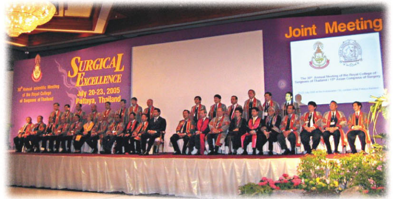
Opening Ceremony of the 15th Asian Congress of Surgery