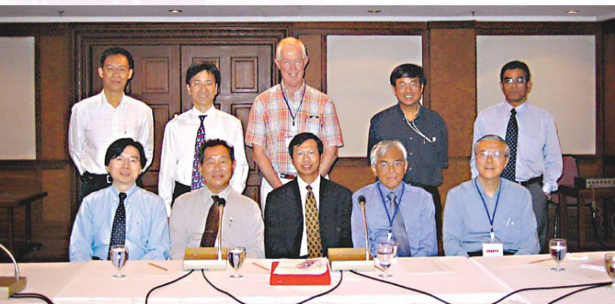
The Officers and the Council of the Asian Surgical Association